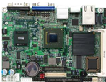
X86 CPU WinXP or Linux