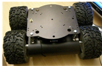
Wifibot Lab (RS232)