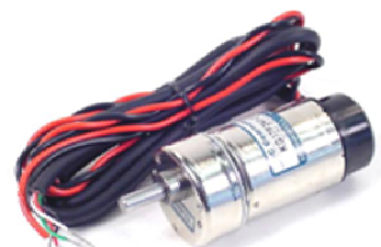
Motor + Hall Coders